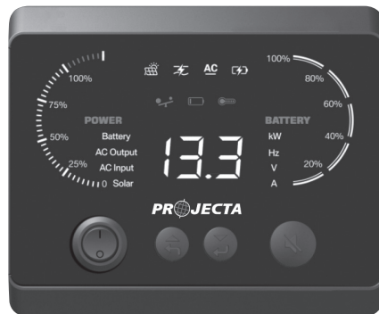
LBM-BT Lithium Battery Monitor